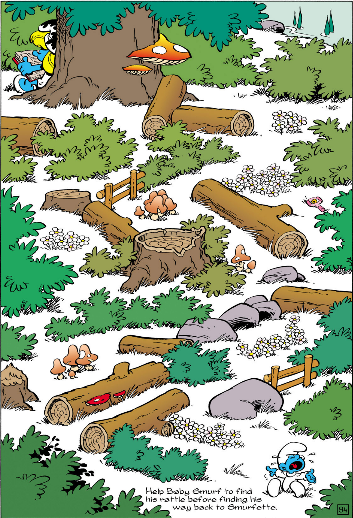
Help Baby Smurf to find his rattle before finding his way back to Smurfette.